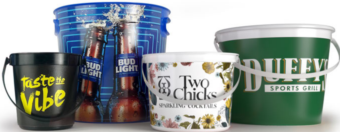
From left to right: 32BKT, 200BKT, 64BKT, 170BKT

New at Churchill Container, handled IML buckets are light weight and versatile. These unique buckets make for a great beverage bucket, popcorn bucket, candy bucket, and more!