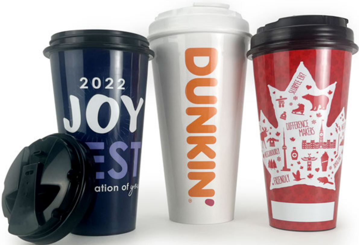
From left to right: 16DW, 24DW, 16DW

Handled IML buckets are light weight and versatile. These unique buckets make for a great beverage bucket, popcorn bucket, candy bucket, and more!