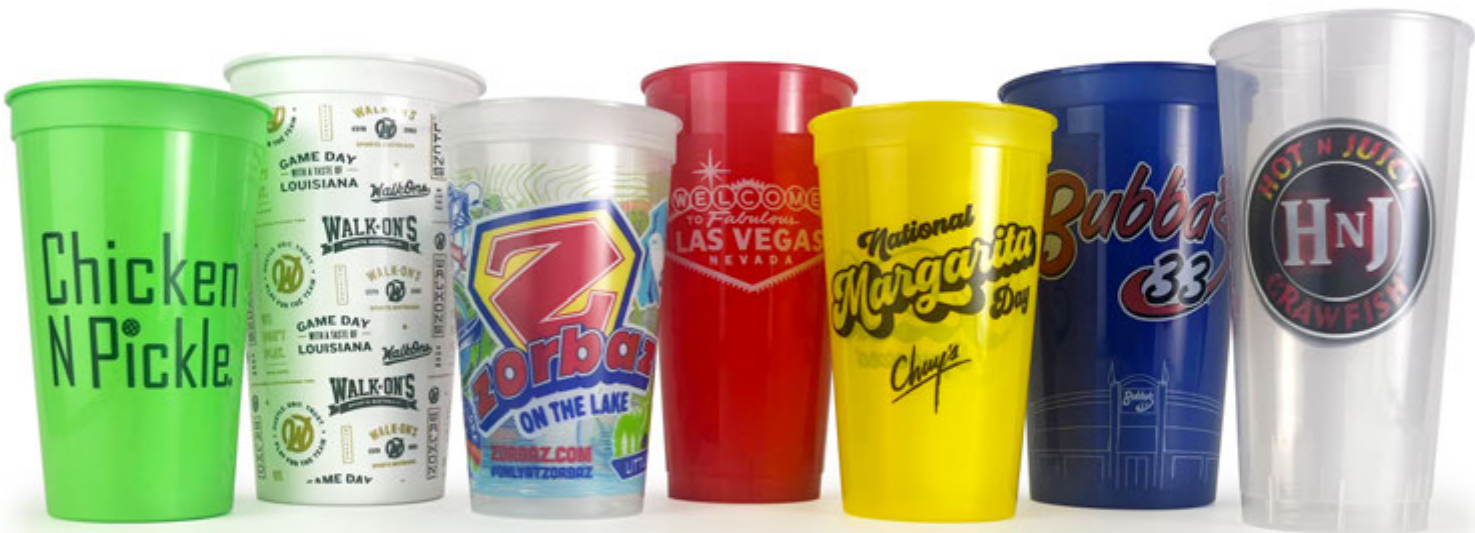
From left to right: 20SC, 32SC, 20SC, 24CC, 20SC, 32SC, 24CC

Traditional reusable stadium-style cups are a tried & true classic that look and feel great. You probably have some in your cabinet!