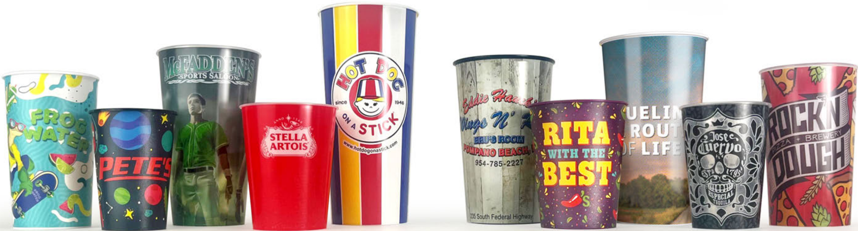
From left to right: 22IMLS, 12IML, 32IML, 16IMLS, 44IML, 32IMLS, 16IMLS, 32IMLA, 12IML, 22IMLS

In-mold labeling takes the traditional reusable cup to a whole new level with durable, full-cover, photo-quality decoration. IML allows for unique features such as inside print, ultra-clear resin, metallic foil, and custom colors to set products apart.