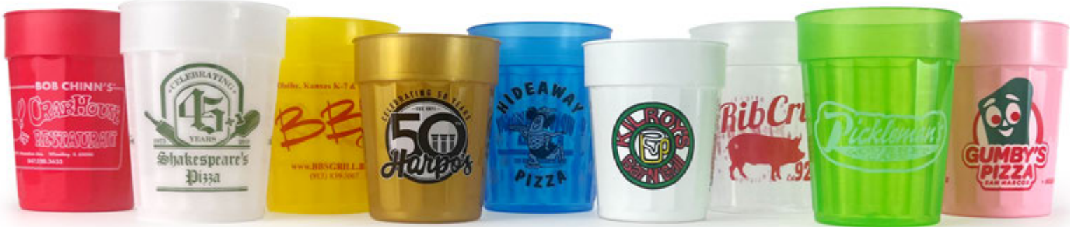
From left to right: 22FC, 22FC, 22FC, 16FC, 22FC, 16FC, 22FC, 22FC, 22FC

A bar and restaurant favorite! Two fluted cup size options make for a perfect 16oz cocktail and 22oz beer set.