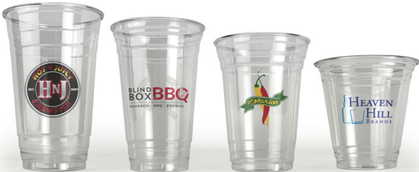
From left to right: APC24, ACR20, APC16, ACR12

Exceptional clarity and high structural strength makes PET the material of choice for a “premium” looking disposable cup.