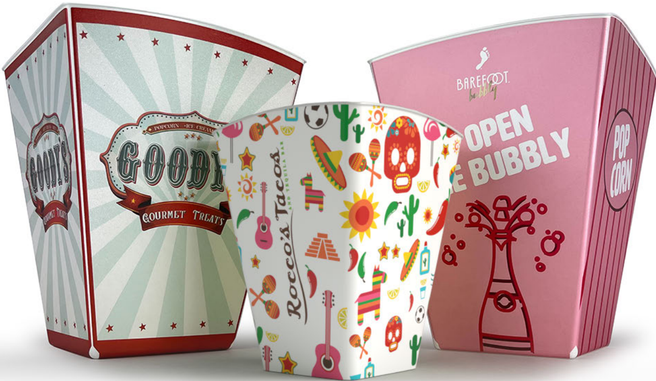
From left to right: 160BKT, 48BKT, 160BKT

IML buckets offer a huge canvas of full-coverage, photo-quality decoration, great for everything from popcorn to long-necks.