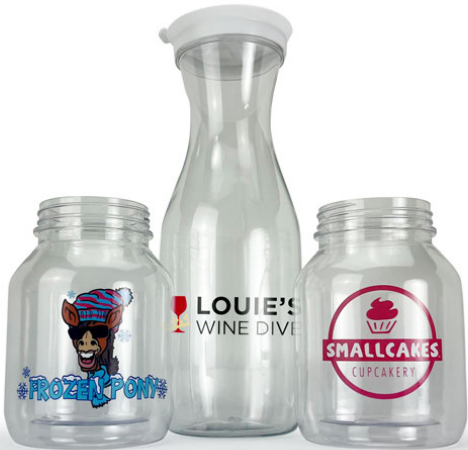
From left to right: 20MJ, 1L-CARAFE, 20MJ